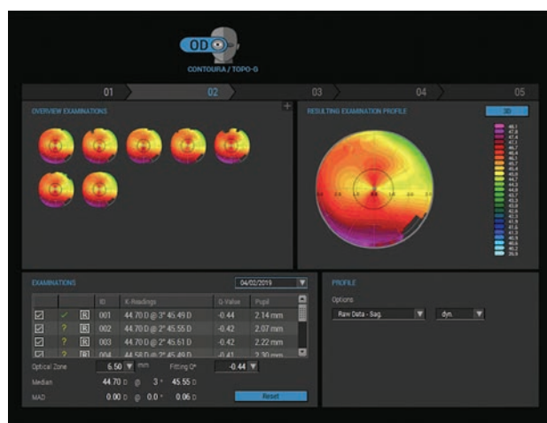
Figure 1. Seven topographical Vario images of a patient's right eye sent for treatment planning via the Alcon WaveNet system.

Cyclotorsion commonly occurs when patients transition from an upright position (typical for preoperative measurements) to a supine position during surgery. Patient eyes